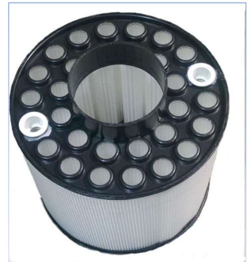
Underside of filter

STEPROS LLC 120 Gambill Lane La Vergne, TN 37086 Tel: (615) 427-1824